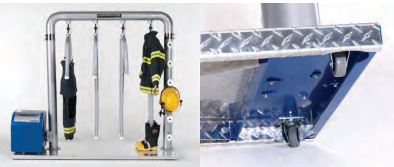
drying for all gear components