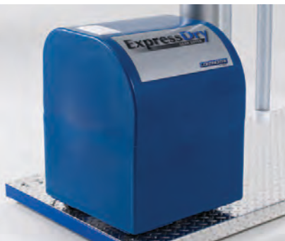
powerful 800 cfm 110-volt blower