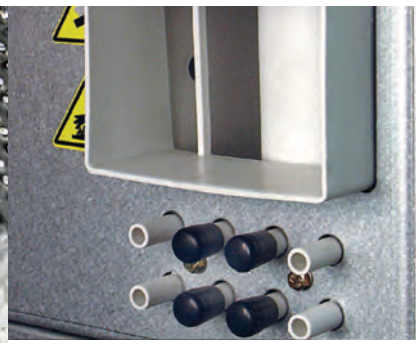
Automatic chemical injection ports