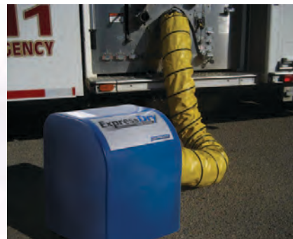
removable blower for drying pumper plumbing