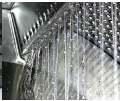
AquaFall water-saving system