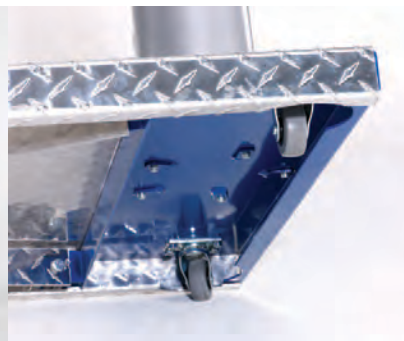
casters for mobility