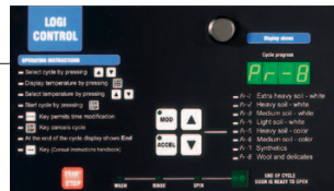
LOGI CONTROL LOGIC MICRO-G-DRIVE