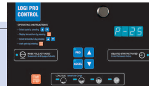
LOGI PRO LOGIC PRO MICRO-G-DRIVE