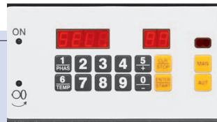
PM CONTROL PREMIER MICRO-DM DRIVE